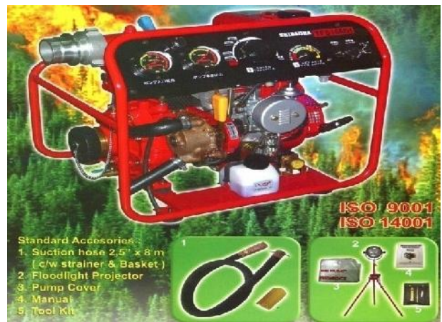
Shibaura Portable Transfer Pump