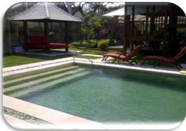
VILLA - NUSA DUA, BALI