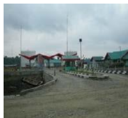
Distributor Terminal Depo For Military and Pertamina