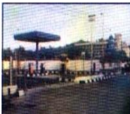
Fuel Station Distributor Military