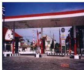
Fuel Station Distributor for Pertamina