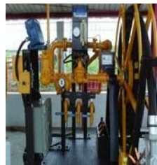
DPPU STPI Curug