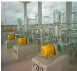
Charging the Aircraft Depot