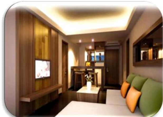
HOTEL - Z DYANAPURA, BALI