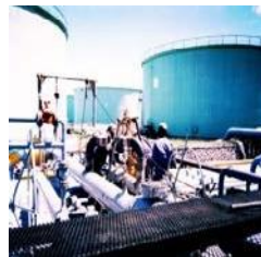
Pipe Installation Depot