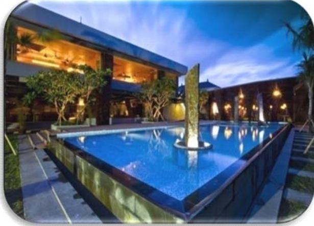
HOTEL INNAYA KUTA BEACH CLUB, KUTA, BALI

General Contractor – Trading – Supplier – Transportation – Wooden House Knock down Tank Builder - Flow System Instrument – Building Maintenance Unit Gondola