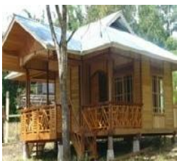
Wooden House Knockdown

We also carry Automation System, Wooden Houses knock down, Maintenance Gondola, Provide: Equipment Aviation, Strainer, Flow meters, Flow Computer, Control Valve,