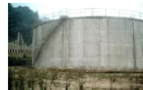
Vertical Steel Tank