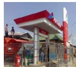
Fuel Station Fisherman