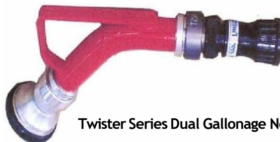
Twister Series Dual Gallonage Nozzle