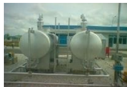
Horizontal Steel Tank