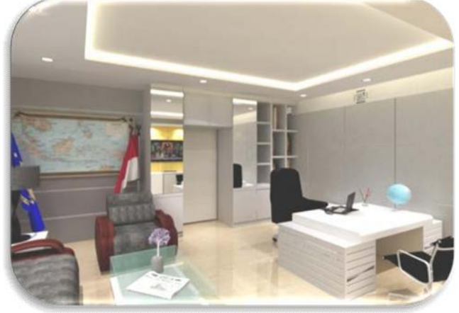
RENOVASI RUANG KANTOR SLOGAL, MABESAL